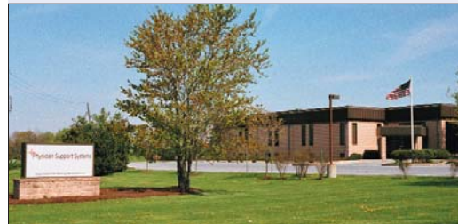
Our 25,000 sq. ft. main office is located in a scenic rural setting in Lancaster County, PA.