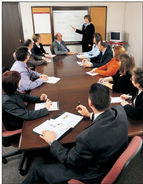
PSS Client Service Executives